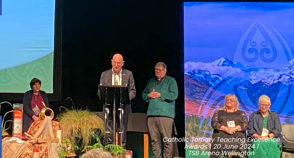
Catholic Tertiary Teaching Excellence Awards | 20 June 2024 | TSB Arena, Wellington