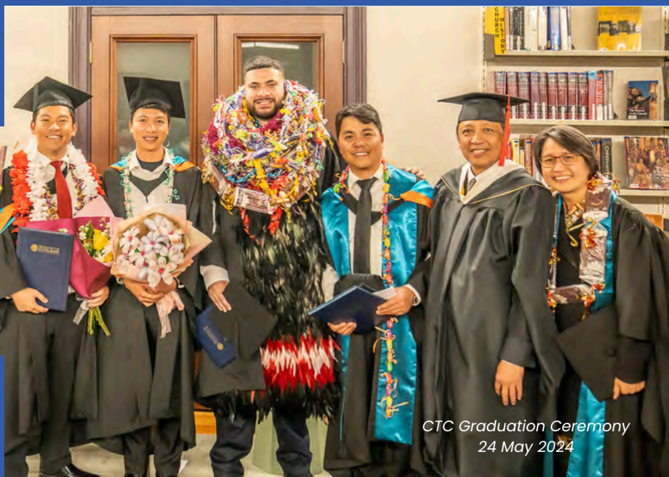
CTC Graduation Ceremony 24 May 2024